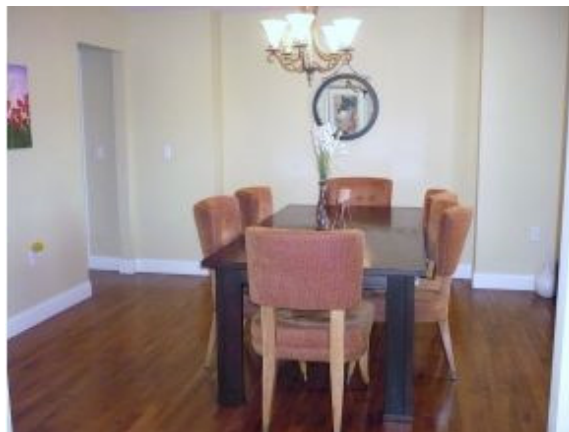
Copyright 2011 Bloomington MLS, Inc. 01/10/2011 01:22 PM