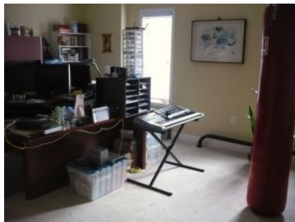
01/10/2011 01:22 PM