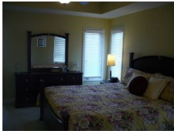
01/10/2011 01:22 PM